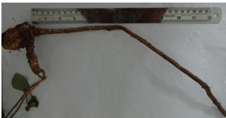
Figure. 1: Macroscopic Characteristics of Argyreia pilosa Wight & Arn. Root

Various reagents were utilized to check the fluorescence activity. In this, 0.1 g of plant powder was blended with 1.5 ml of respective reagent. The mixture was placed on the slide for a minute and observed under visible light, short ultra-violet light (254 nm) and long ultraviolet light (365 nm) [18].